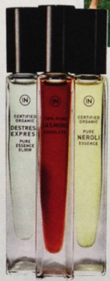
Essential oils One dab makes Savasana even better. $42 to $128; IntelligentNutrients.com