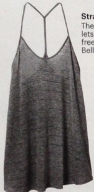
Strappy tank The loose cut lets you move freely. $68; BellaLuxe.com