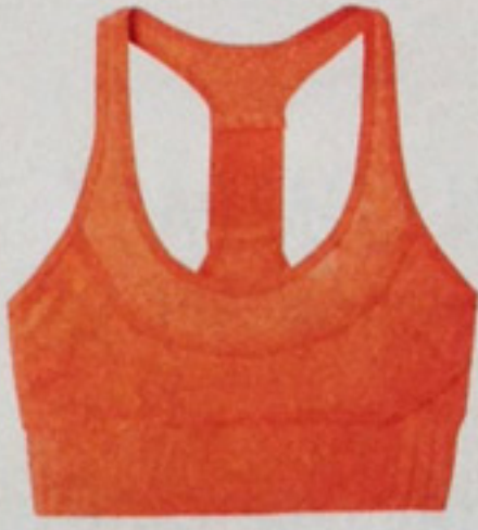
Bright bra A flash of color is a little sexy. Adidas by Stella McCartney, $70; Adidas.com