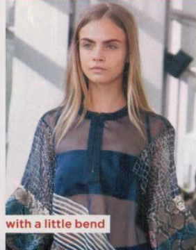
with a little bend