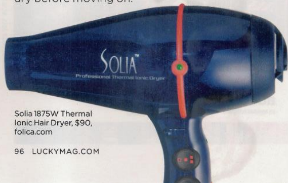
Solia 1875W Thermal Ionic Hair Dryer, $90, folica.com

STEP 3: "Divide your hair into four sections: front, back, left, right. Start at the back and blow-dry your way forward with a paddle brush; point the dryer at the brush and slowly pull the brush downward to the ends, following it with the dryer. Make sure each section is completely dry before moving on."