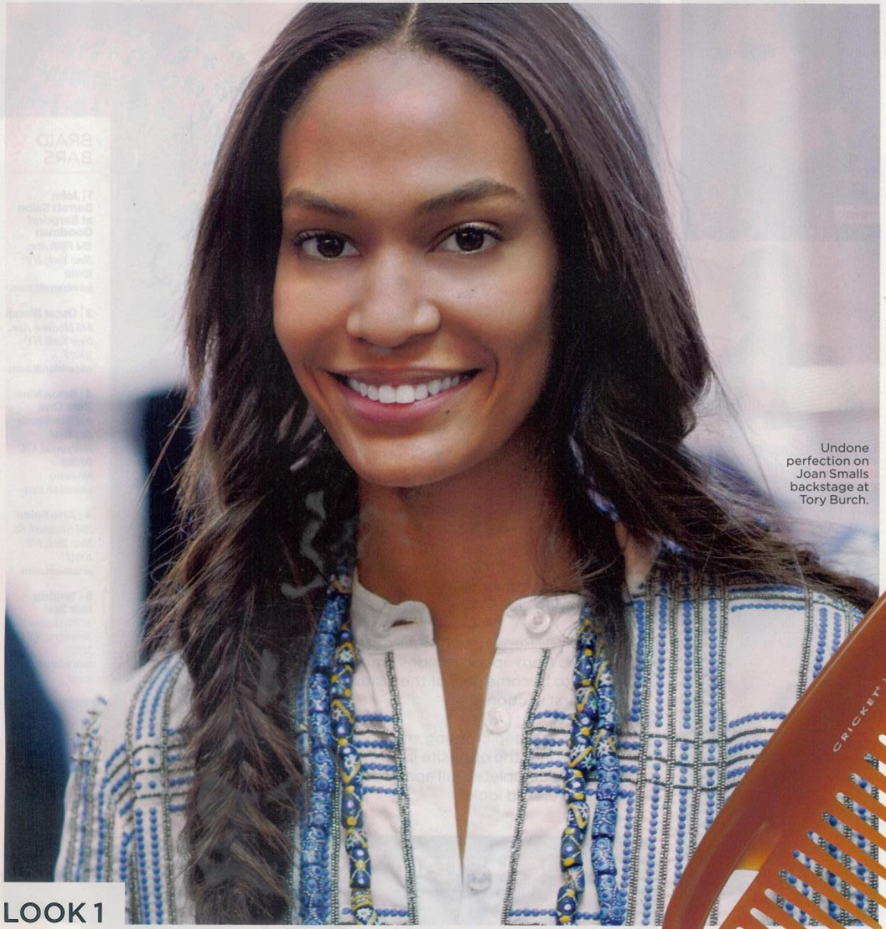
Undone perfection on Joan Smalls backstage at Tory Burch.